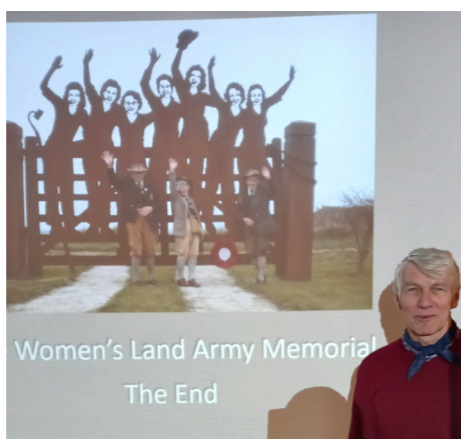
Women's Land Army Memorial The End